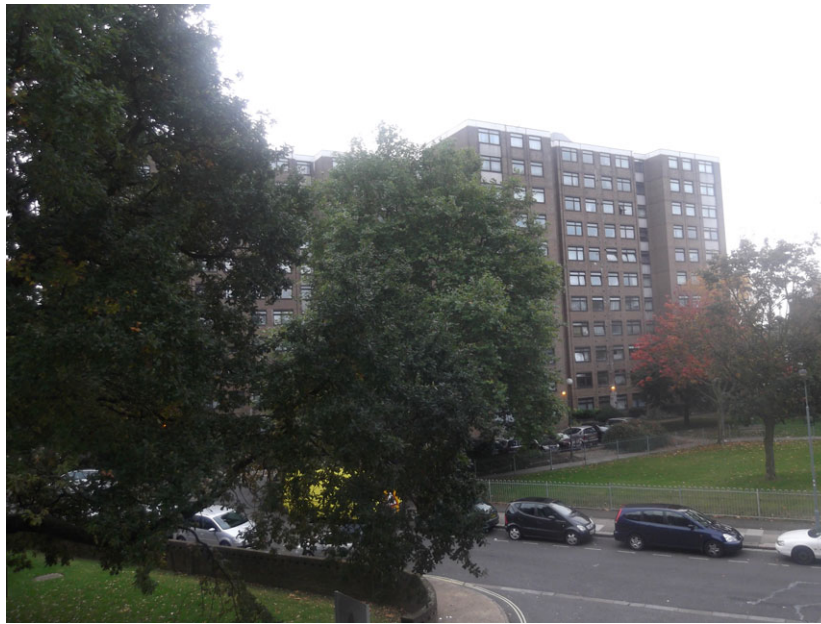
Figure 4. Enesa's view from her balcony

RW = I thought we liked bright things. You chose something bright.