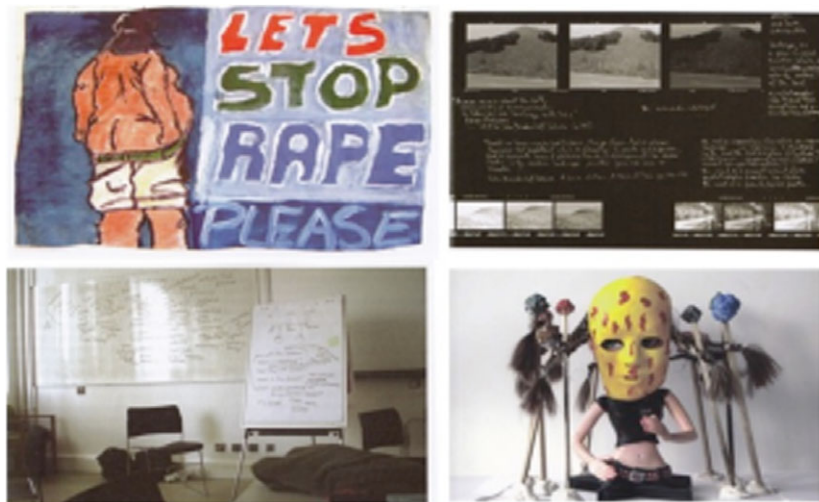
Figure 2. Examples of images of student artwork from the International Journal of Art and Design Education , Vol. 31, No. 3 (2012)