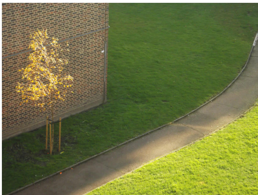
Figure 3. Kamaudin's photograph of the view from his balcony

Another discussion at Greystones School revealed some children were aware of how light can momentarily beautify a landscape. Kamaudin shared a photograph taken from his balcony on a housing estate, of a small tree caught in a shaft of sunlight, its yellow leaves illuminated against a brick wall (Figure 3). A