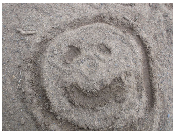
Figure 7. Spike's smiley face in the sand

Spike's reflections on his images contrast with previous accounts of children's perceptions of beauty. Parsons (1987) concluded that children of Spike's age admire the technique involved in creating realistic paintings. Furthermore, he argued that children believe paintings can only be beautiful if they represent beautiful subjects. Viewed independently, Spike's image is unremarkable; studied in the context of his commentary on the image, it is a striking representation of his perception of the relationship between emotion, expression