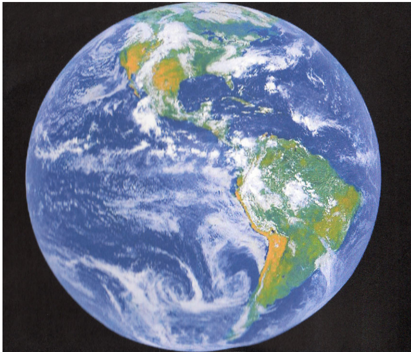
Figure 5. Jasmine's image of a distant view of the earth

blend in with the blue ocean and the lands. You can see where you are ... and everything blends in, the ocean, and all of the land, just sort of come together. . .